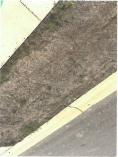
Glacier Bay Place