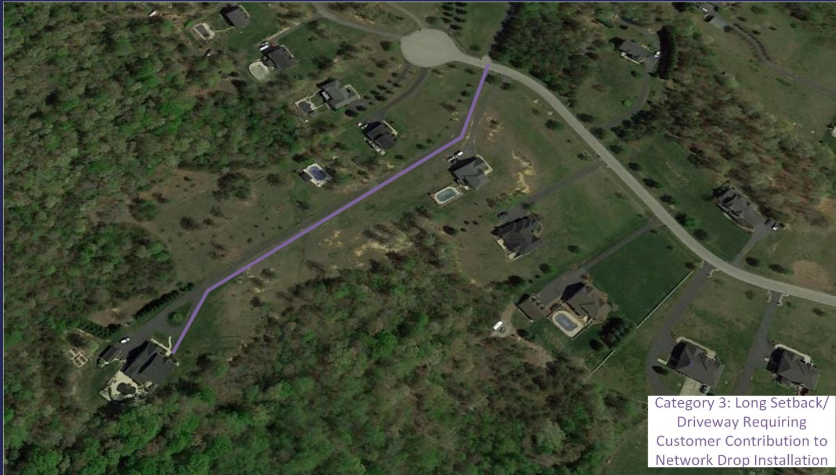
Category 3: Long Setback/ Driveway Requiring Customer Contribution to Network Drop Installation

Category 3: Locations at the end of long setbacks/driveways requiring customers to contribute to the cost of installation of the “service drop”