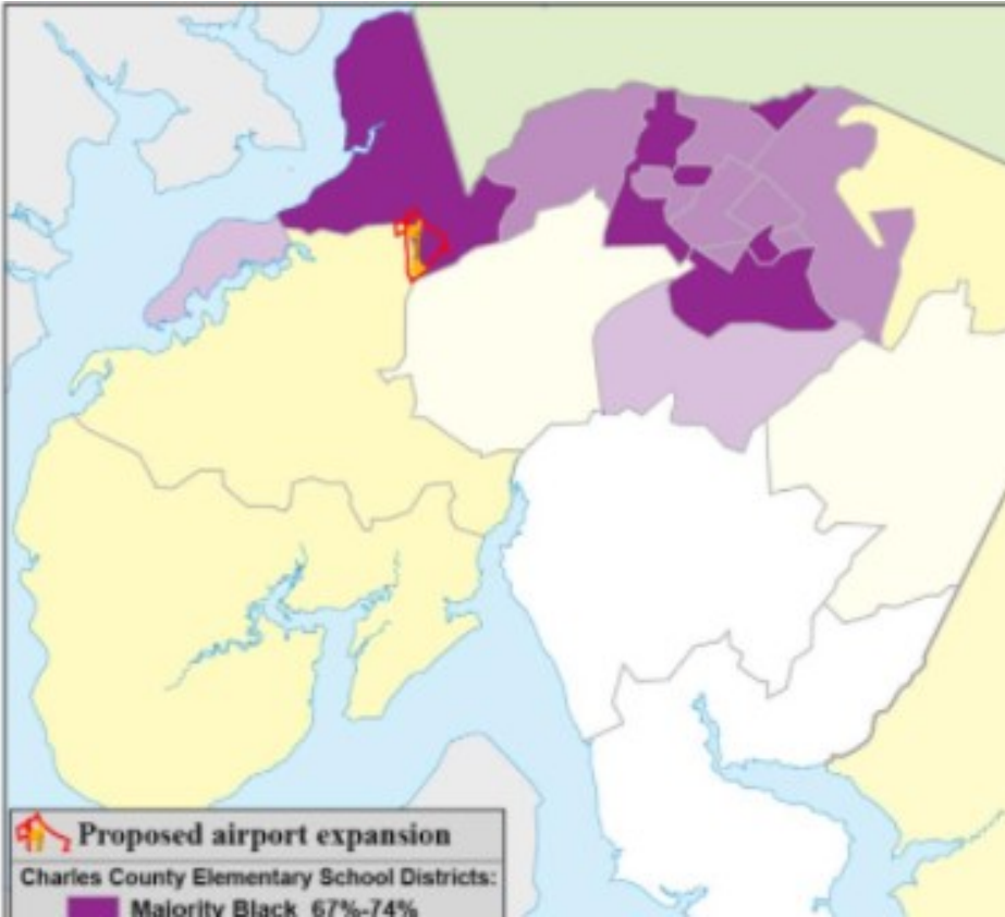
Mattawoman Creek a majority-minority watershed

Note on the protection provided by the Resource Protection Zone, (RPZ): in Waldorf Station BOA case - RPZ was removed with no public participation and no public notification.